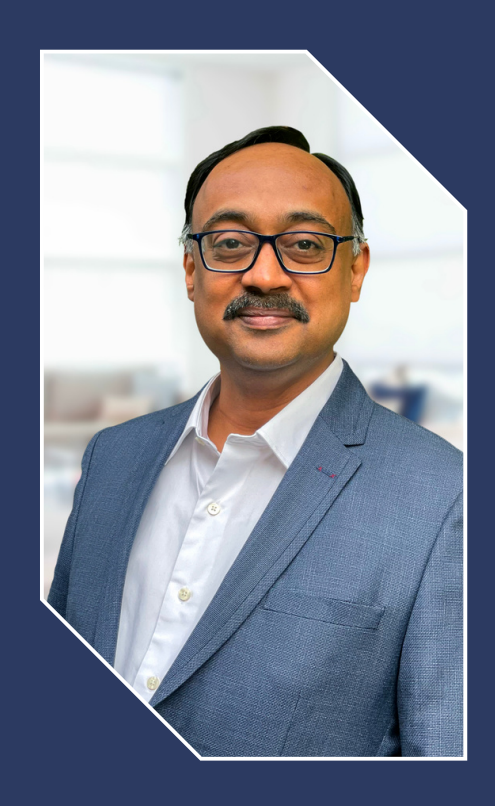
Director-Finance & Operations Astrikos Consulting Pvt. Lt